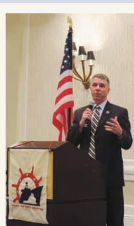
Congressman Rob Wittman VA 1 st District