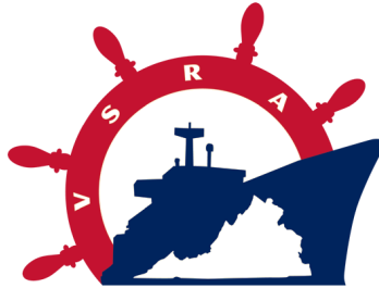
VIRGINIA SHIP REPAIR ASSOCIATION

The Virginia Ship Repair Association offers many valuable sponsorship opportunities, primarily through its world-class professional seminars. These seminars provide an opportunity for employees to earn professional training credit hours, as well as network with industry peers. Content is developed by subject matter experts and industry leaders, providing an invaluable link between the material presented and the most current needs of the ship repair workforce.