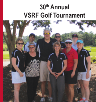
30th Annual VSRF Golf Tournament