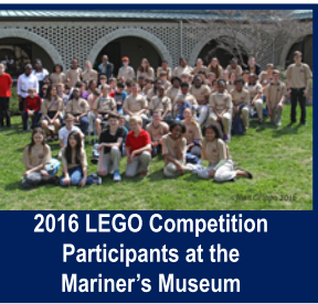
2016 LEGO Competition Participants at the Mariner’s Museum