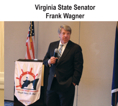
Virginia State Senator Frank Wagner