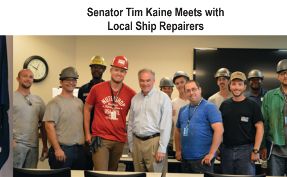
Senator Tim Kaine Meets with Local Ship Repairers