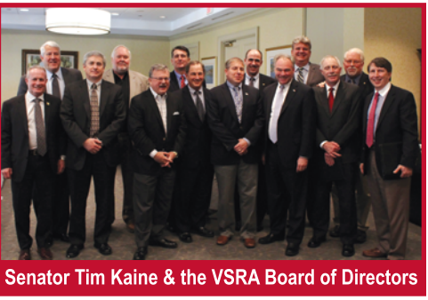
Senator Tim Kaine & the VSRA Board of Directors